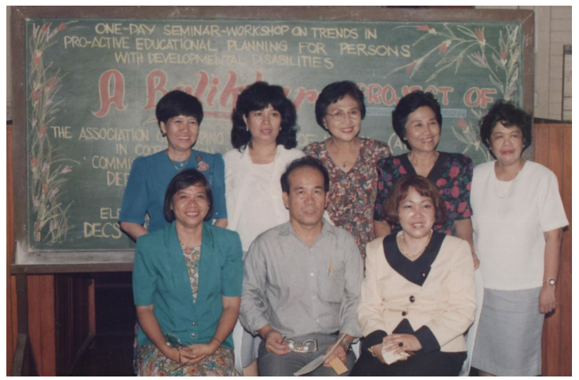
AFTA members during one of their first BalikTuro series in the 1990's held at the Philippine School for the Deaf